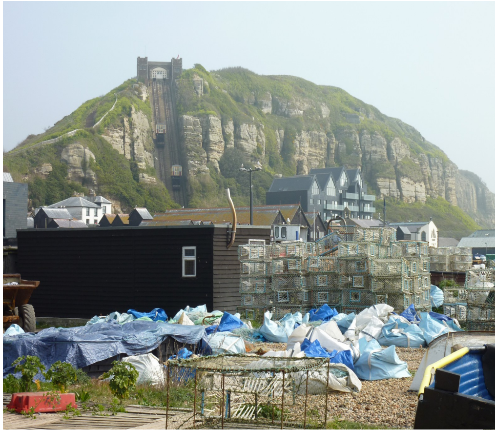
The lift !